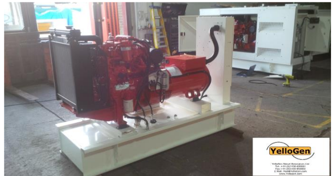
Illustrative purpose only